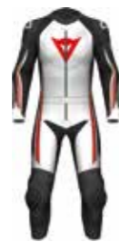
I96 white/black/ fluoro-red