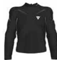
N49 black/black/ fluo-yellow new color option