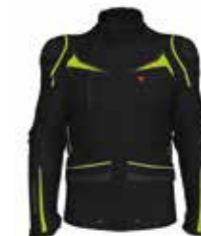
N49 black/black/ fluo-yellow new color option