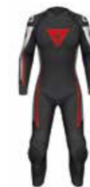
N32 black/white/ fluoro-red