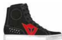
C59 carbon-dark/red new color option