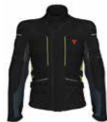
N49 black/black/ fluo-yellow new color option