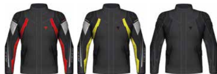
Y22 black/glacier gray/ red