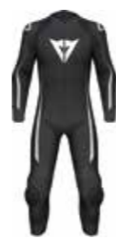
948 black/black/ white PERFORATED