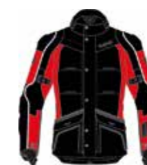
606 black/red new color option