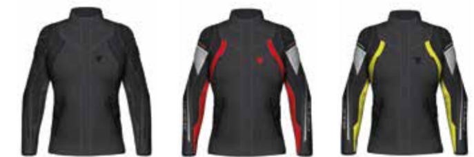
691 black/black/ black