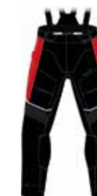
606 black/red new color option

Dainese modular flap system on tights Water-resistant outer fabric Perforated breathable Sanitized® fabric liner Removable liner with breathable waterproof GORE-TEX® membrane Removable thermal liner