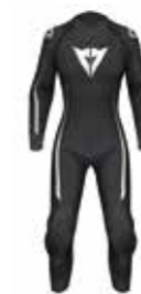
948 black/black/ white