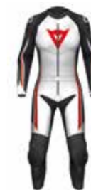
I96 white/black/ fluoro-red