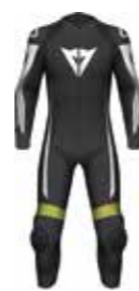
Q90 black/white/ fluoro-yellow