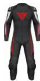
N32 black/white/ fluoro-red PERFORATED